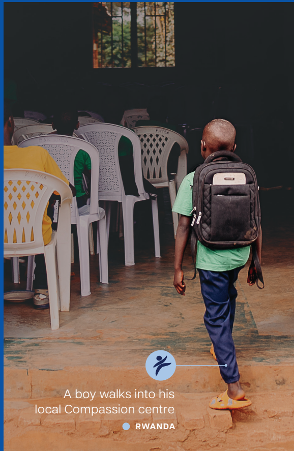
A boy walks into his local Compassion centre

Speaking up for the world's most vulnerable children can change lives. Discover the powerful reasons why your voice matters.